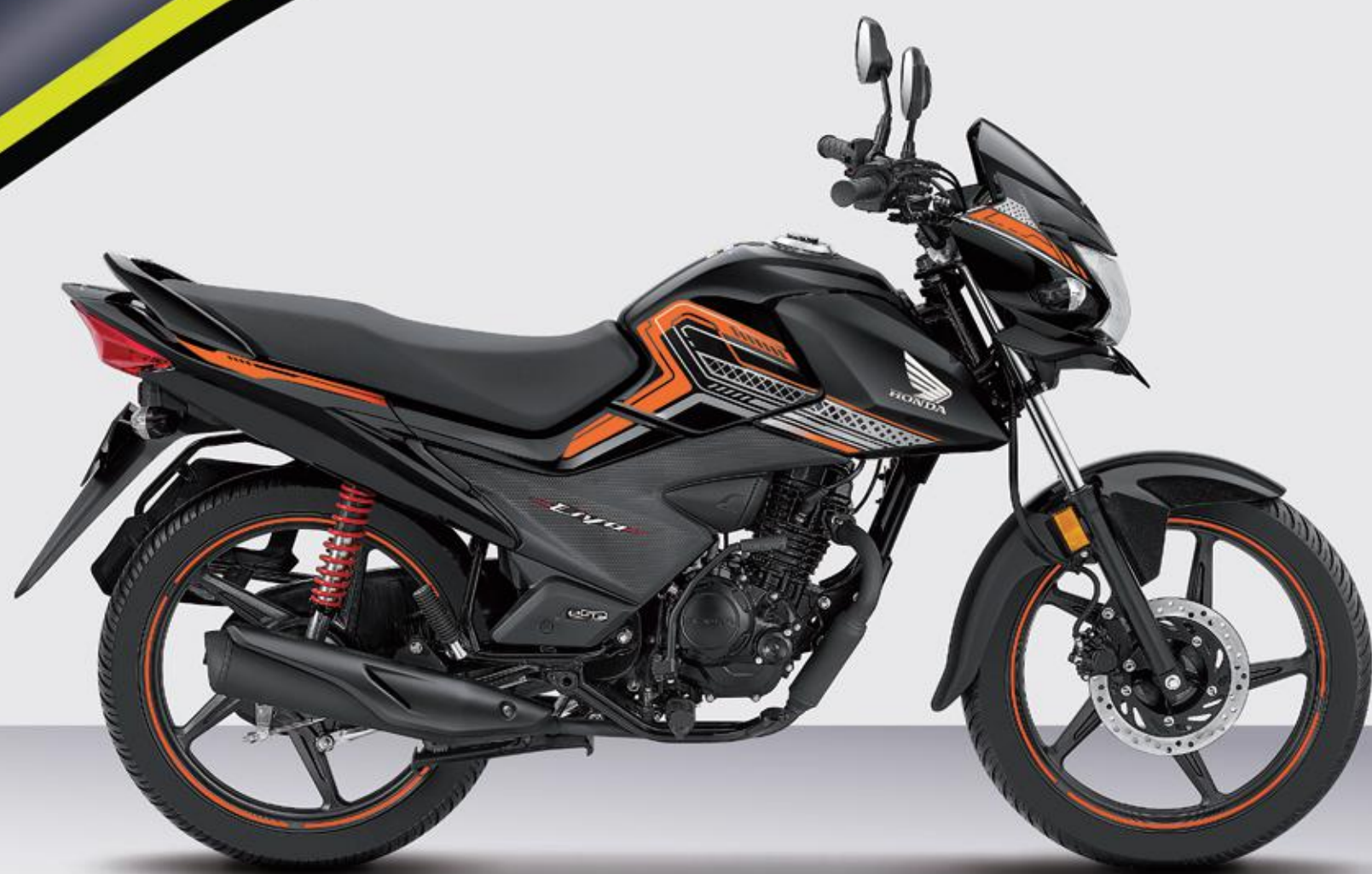
PEARL IGNEOUS BLACK (Pearl Igneous Black Shroud + Orange Stripes)